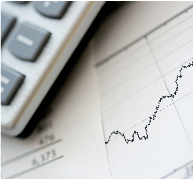
Delivering key financial information to over 17 million investors every day

For these types of organisation, efficient, secure and accurate data handling is of prime importance. The right pieces must be sent to the right people at the right time. After reviewing all its existing print production facilities, the business identified the need to streamline document production and composition to reduce costs and offer clients more flexibility.