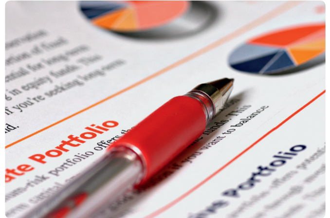
Bringing new services to improve customer satisfaction

Its aim is to be the industry benchmark for client satisfaction, building long-term partnerships by not only consistently meeting its commitments, but exceeding client expectations. Clients are invited to use IFDS' services and technology in a way that best suits their business and as customer requirements evolve, it is important for IFDS that it retains the flexibility to change with them.