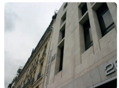
ProCapital's offices on the prestigious Avenue des Champs Elysées