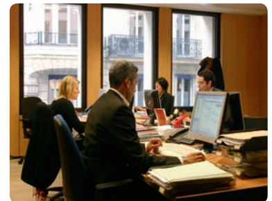
The Projects and Information Systems team at ProCapital