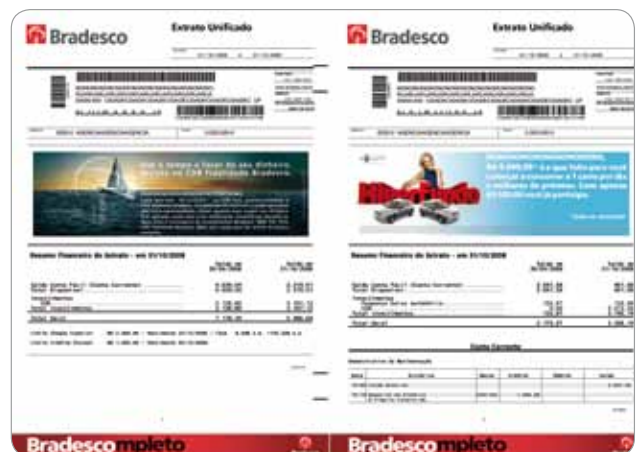
Images and color enhance the message and increase response rates