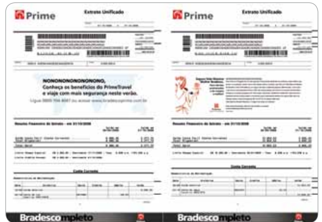
Messaging is limited with text