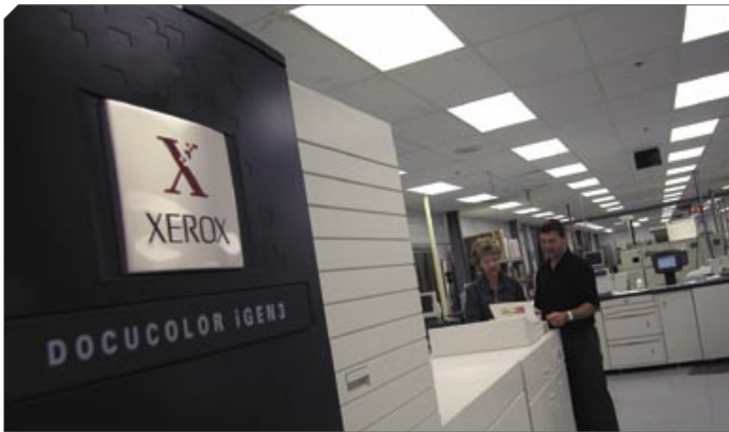
PrintNet T works with modern full color printers and existing infrastructure

Communication Data Services, Inc. (CDS) – the leading provider of data management and customized magazine and product fulfillment services – offers highly personalized and content driven full color communication with GMC PrintNet T software and Xerox Docucolor iGen3 printer.