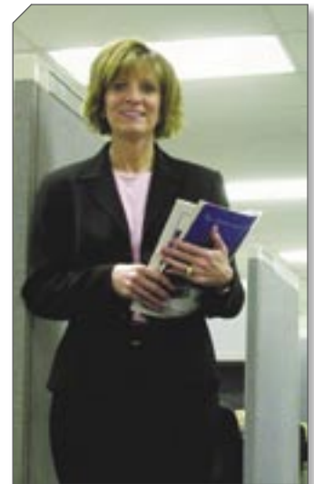
PrintNet ensures the use of a consistent workflow across the communication products

was previously possible. Results have shown an astounding 26% improvement in client response. "Since our host site is in the Des Moines headquarters, and our lettershops are in Wilton and Tipton, we feed data to printers from a local area network at each site," said Williams. The benefits of using PrintNet T functionality across all CDS facilities are: uniform backup, easier training, less IT support and the use of a consistent workflow for a wide variety of communication products. The two lettershops combined produce over 550 million pieces of letter mail a year.