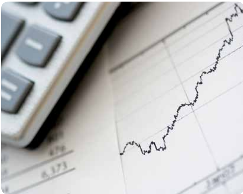
Delivering key financial information to over 17 million investors every day

After pre-processing the data, the print was outsourced to external print providers. However, customer feedback showed that this system did not provide the service levels and turn-around times that IFDS wanted and customers had come to expect. There was also room for improvement in the design process with functions such as merging multiple data sources into a single envelope, gathering data from external data bases, dynamic marketing messaging, version control, data manipulation and design complexity.