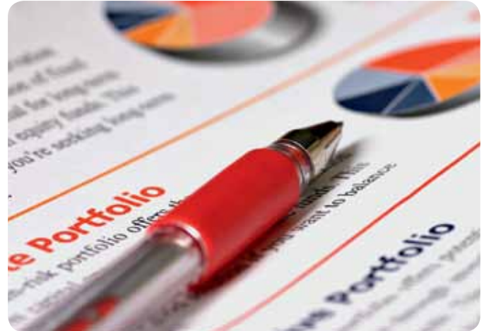
Bringing new services to improve customer satisfaction

IFDS needed a system which could manage all aspects of the production workflow: a system that caters for complex data processing and integrates mailsort and print file generation – wherever that might be.